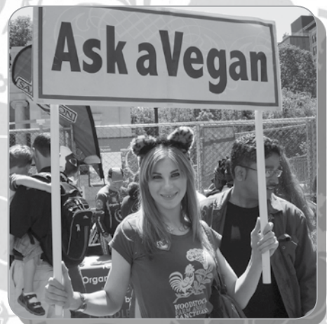
Above images are of Veggie Pride Parade NYC 2008, 2009, 2010 & 2011. Picture credits can be found on the back page.