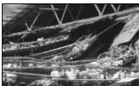
Suddenly a million hens were trapped in a twisted wreckage of metal and mesh left by the tornado. All life supports were cut off, leaving little hope for the birds.

Buckeye is the fourth-largest egg producer in the United States, now with 14 million birds, a million fewer than before the tornado. It supplies about 4 percent of the nation's eggs.